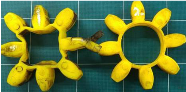
Fig. 1: A worn spider next to a new one

Experience has shown that the spider of the couplings connecting the electric motors and hydraulic pumps on the HPS on ME-B engines may wear out prematurely. An example is given in the picture below.