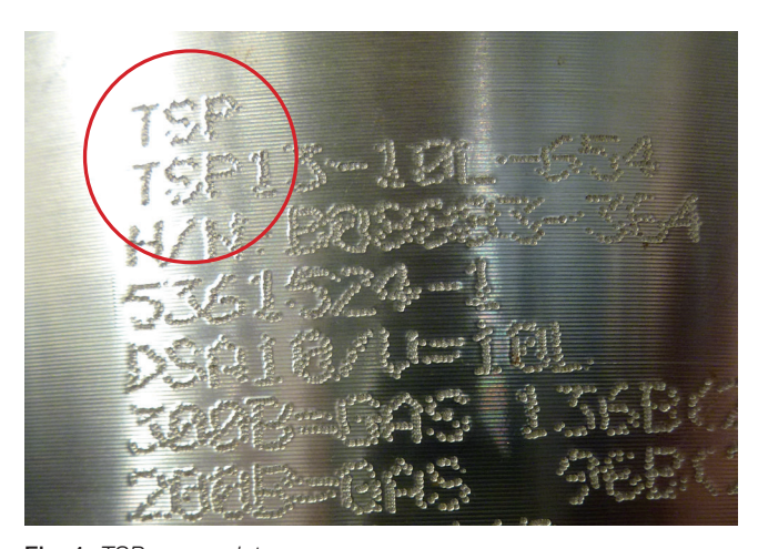
Fig. 1: TSP accumulator

The TSP accumulator can be identified as shown in Fig. 1.