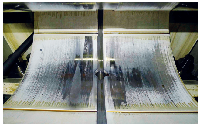
Figure 2: Bearing of modified design at 12012 hrs.

where it is seen that some redistribution of the lead overlay has occurred during the test period. This is a normal and acceptable sign of adaption between the surfaces. Otherwise, the bearings have nice appearances without any signs of fatigue cracks. As a consequence of the successful service tests, the updated design is the new standard for K98 and K/L90 engines. The bearing upper shell design has not been modified.