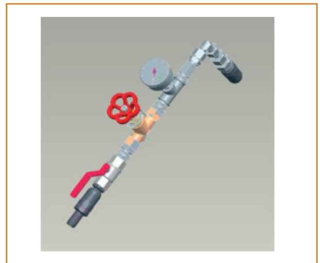
Tool for cleaning of turbine

As not all injected water is evaporated, turbochargers need to be fitted with a drain from the exhaust gas outlet. For engines delivered without drain, customers of these engines must contact MAN Diesel & Turbo.