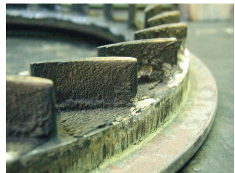
Plate 51215-04/61215-01H, Water washing of turbine side

Work Card 512-15.00 (05)/612-15.00 (03H), Water washing of turbine side