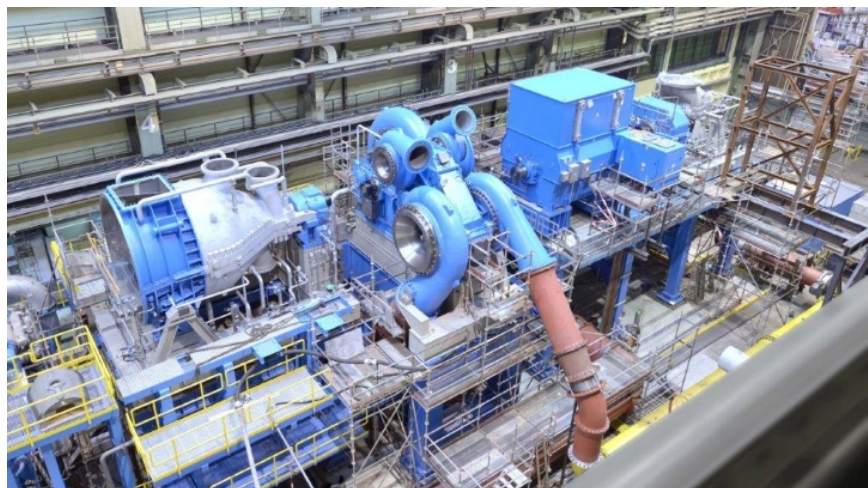
A PTA machinery train by MAN Energy Solutions