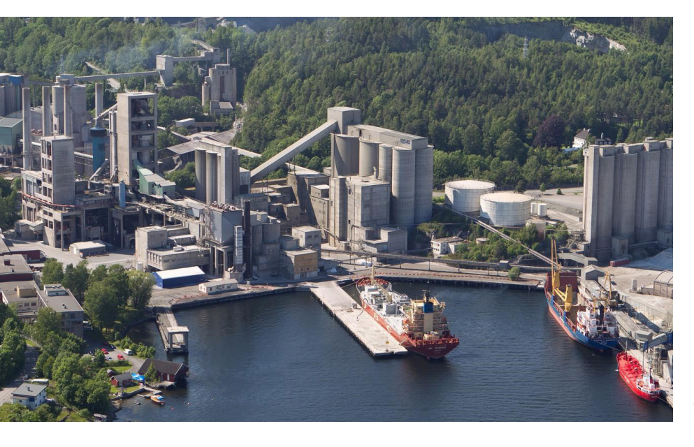
For more information about MAN CCS technology visit: www.man-es.com/process-industry/campaigns/ go-modular-towards-net-zero