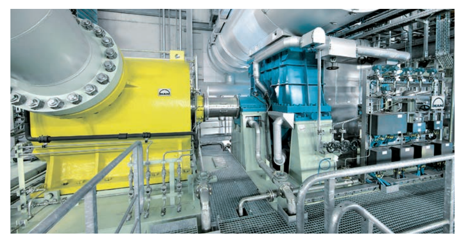
Pipeline compressor and steam turbine. Output: 22 MW